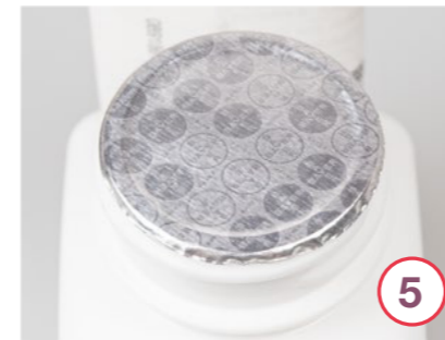
Safety features of Nexavar®-packaging (further variants might be available)